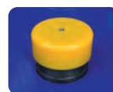
> Anti-depression venting