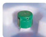
> Two-position venting, Viton sealing gasket