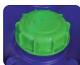
> Cover DN150 special Viton sealing gasket