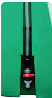
> Frontal venting, valve DN25