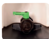
> Ball valve DN50 in GRP, Viton sealing gasket